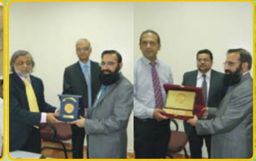
Meeting, Presentation & Seminar with Teacher & Students @ HH Sheikh Rashid School, Dubai