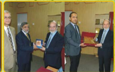
Meeting, Presentation & Seminar @ Pakistan Islamia School, Ajman