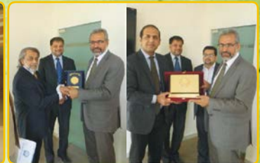
Visit, Meeting & Lunch at RAKCODS (College of Dental Sciences), Ras al-Khaimah