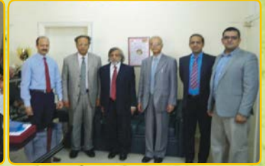
Meeting, Presentation & Seminar @ Pakistan Education Academy, Dubai