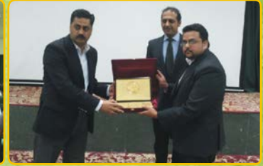
Meeting, Presentation & Seminar @ Pakistan School, Sharjah