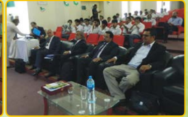
Meeting, Presentation & Seminar @ Sh Khalifa Bin Zayed Pakistan Arab School, Abu Dhabi