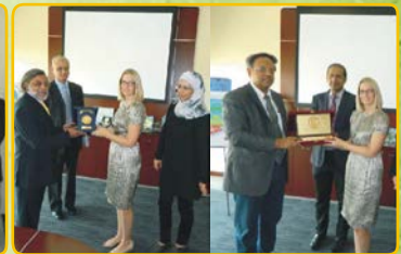
Visit & Meeting @ Dubai International Academic City (DIAC), Dubai